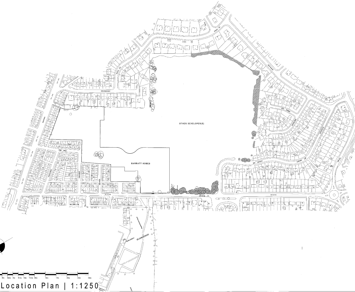
Scale Bar 0m 10.0m 20.0m 30.0m 40.0m 50.0m 60.0m 70.0m 80.0m 90.0m 100.0m 110.0m 120.0m 130.0m 140.0m 150.0m 160.0m 170.0m 180.0m 190.0m 200.0m Site Location Plan | 1:1250